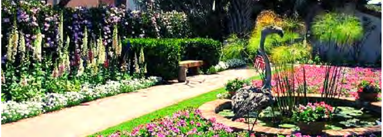
SHERMAN GARDENS - JUNE'S OUTING

July meeting: Monday the 15th. Please pay your Dues!