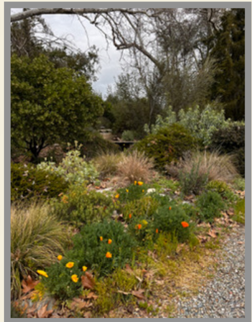
Tree of Life Nursery

We will not be having our own garden tour this month, but I highly recommend gathering your garden buddies together and supporting our neighboring garden clubs' tours this spring. Instead of our own garden tour, we will be gathering for a tour of the Tree of Life Nursery as our outing in April. We will meet at the nursery at 10:00 on April 19th. The address is 33201 Ortega Highway San Juan Capistrano, about 5 miles out Ortega Highway from the freeway, on the left side of the road.