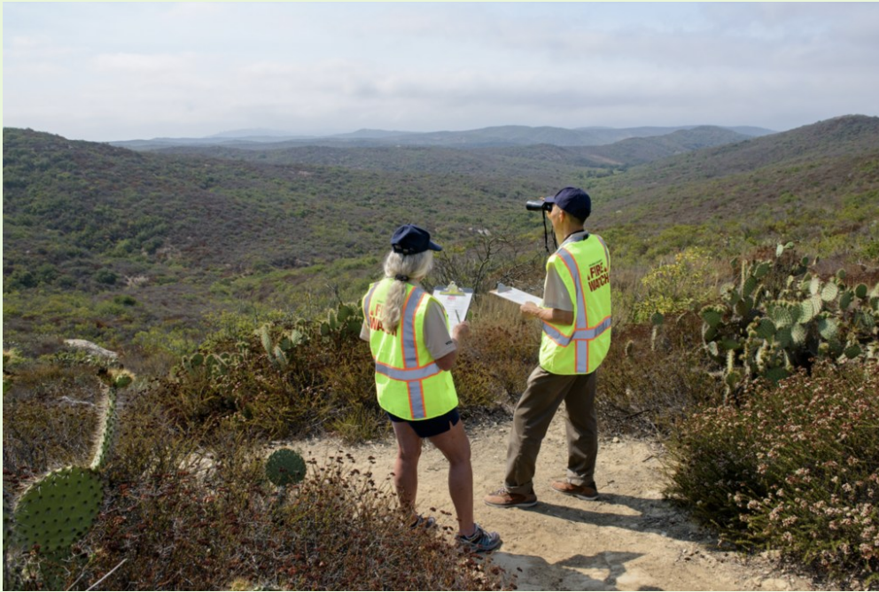
Orange County Fire Watch volunteers participate in a mock deployment in Ridge Park, Crystal Cove.

Wildfires are among the most destructive events that can occur in urban wildlands and pose a serious threat to nearby communities. In preparation for Southern California's peak fire season, Orange County Fire Watch volunteers recently conducted a mock deployment to practice their response protocols.